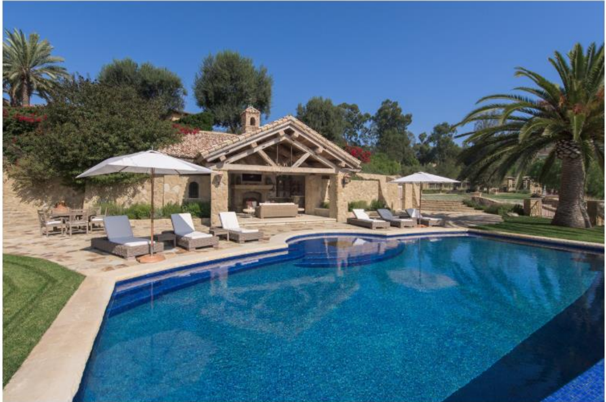
The entire site is about 10.57 acres.