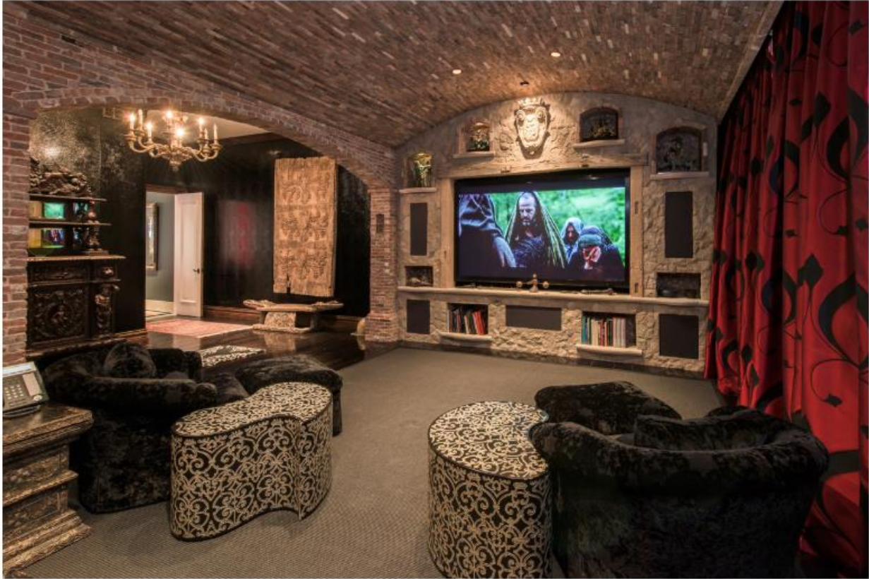
The main house spans roughly 17,000 square feet.