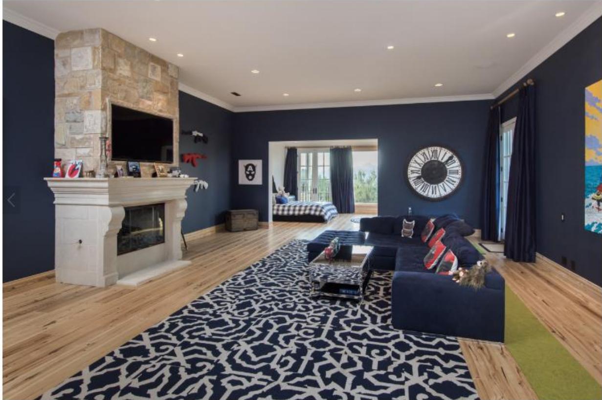
The entire compound spans about 21,000 square feet, including the guest house and the pool pavilion.