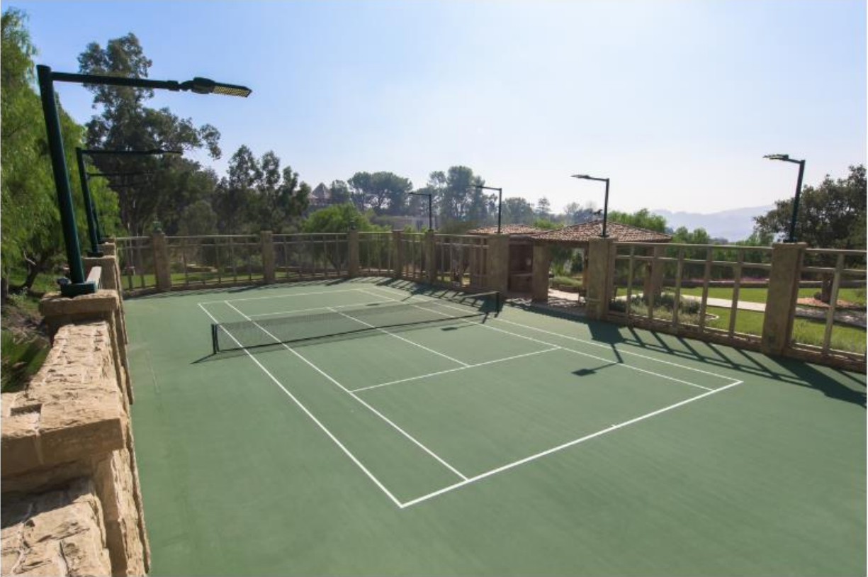
A tennis court.