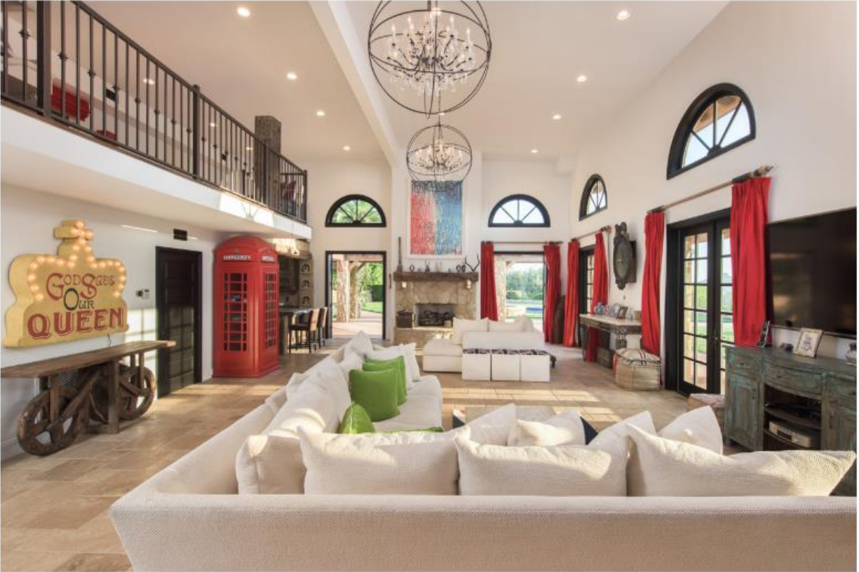
A $72 million Beverly Hills mansion includes a British-inspired room with a London-style phone box.