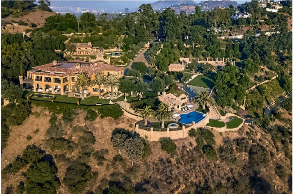
An aerial view of the home.