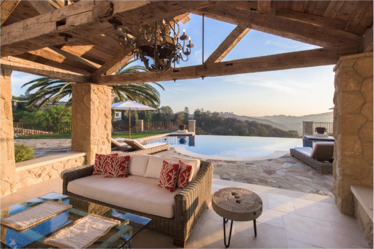
The property has two swimming pools and a wading pool.