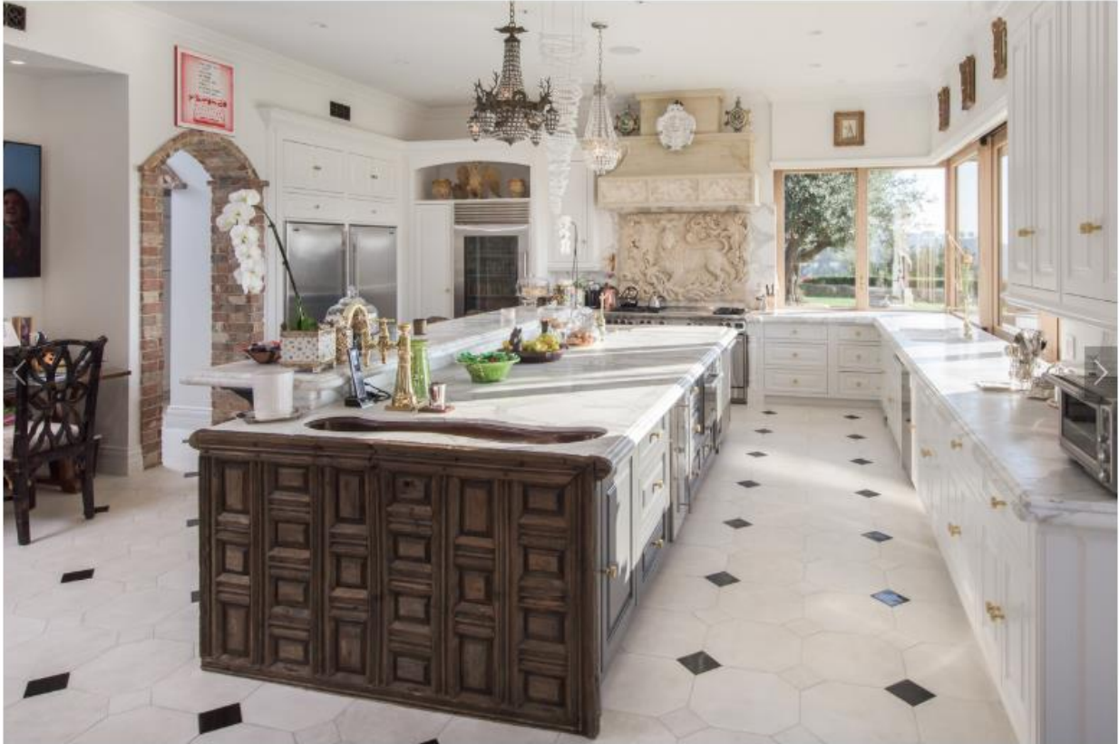
The kitchen.