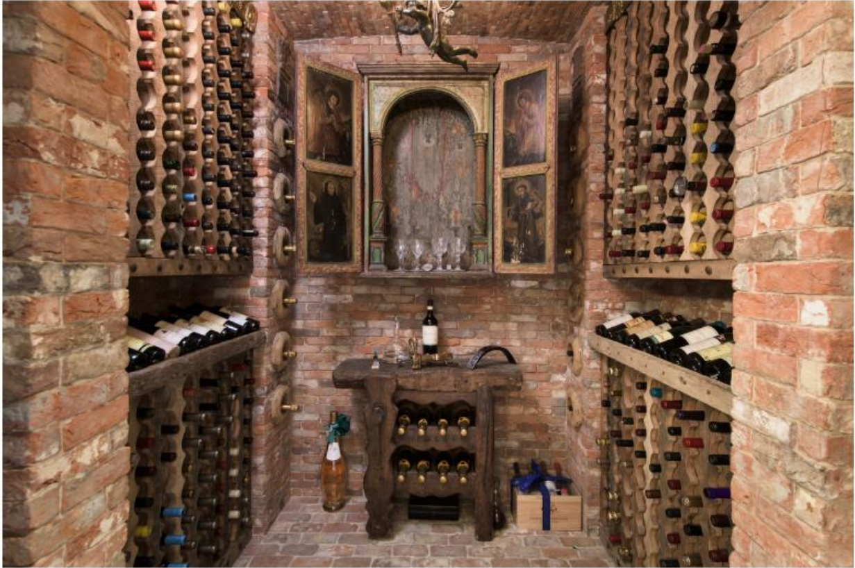
An antique traveling altar in the wine cellar.