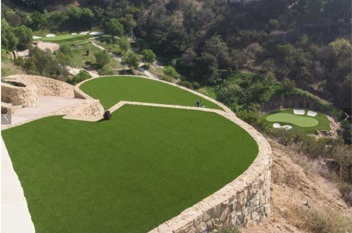
The property has a two-hole golf course.