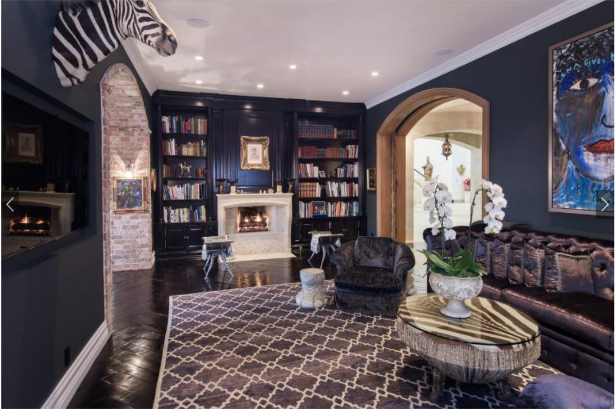
Another living room area.