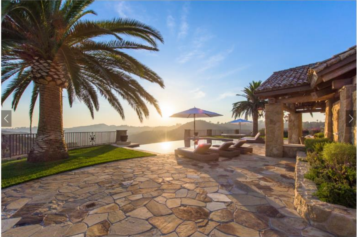
The Dunns bought three separate lots to give them more space.